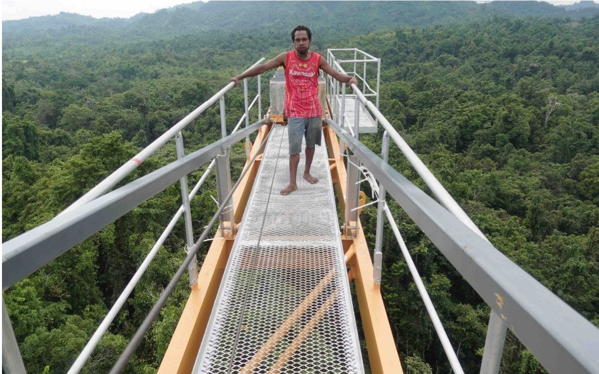
A rainforest canopy research crane at Baitabag near Good Shepard Lutheran High School. You can see Amron Mission from the tower.