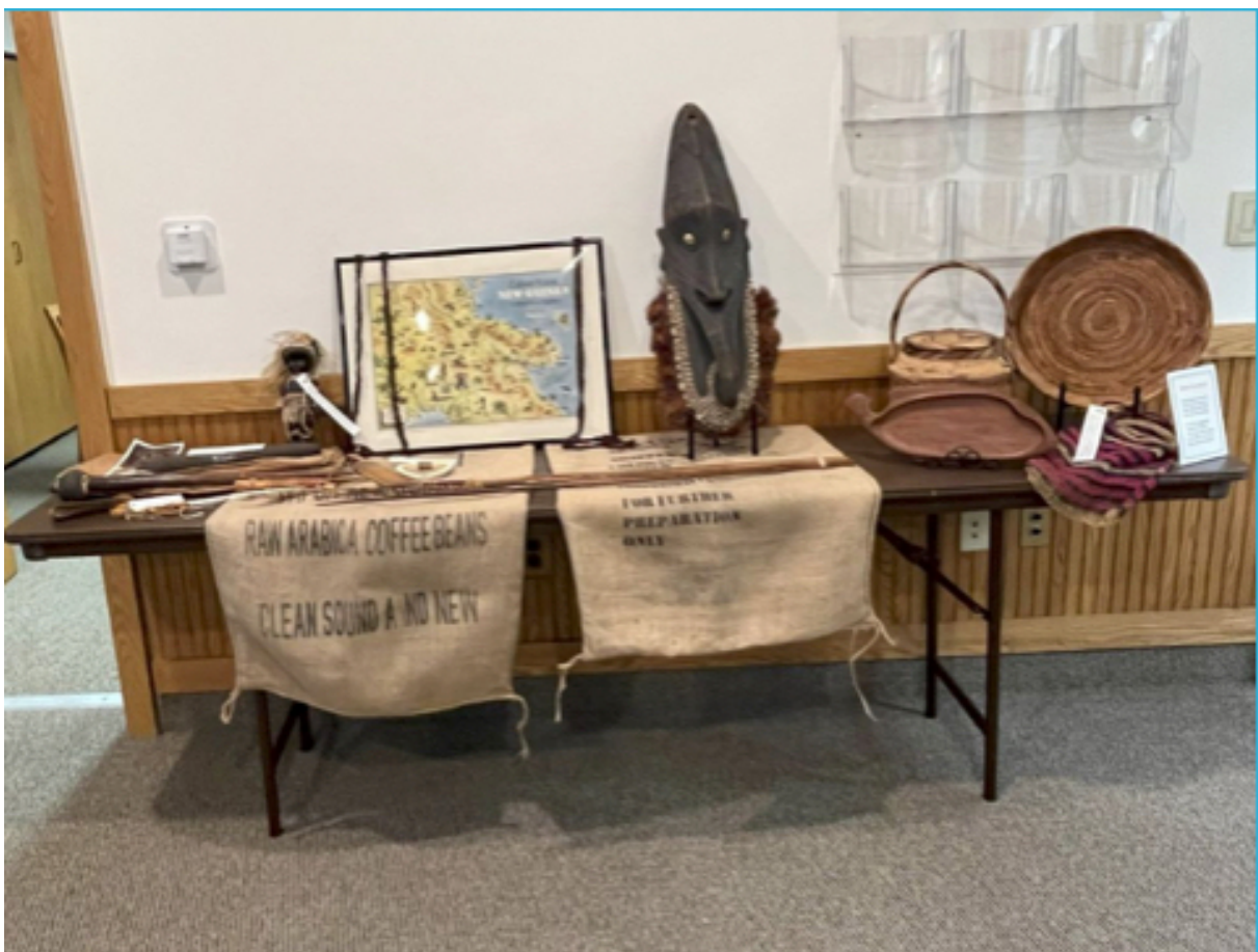
A collection of PNG artifacts at the 2021 PNG reunion.

Starts: Thursday October 5, 2023 at 3 pm Ends: Sunday October 8, 2023 at 2 pm