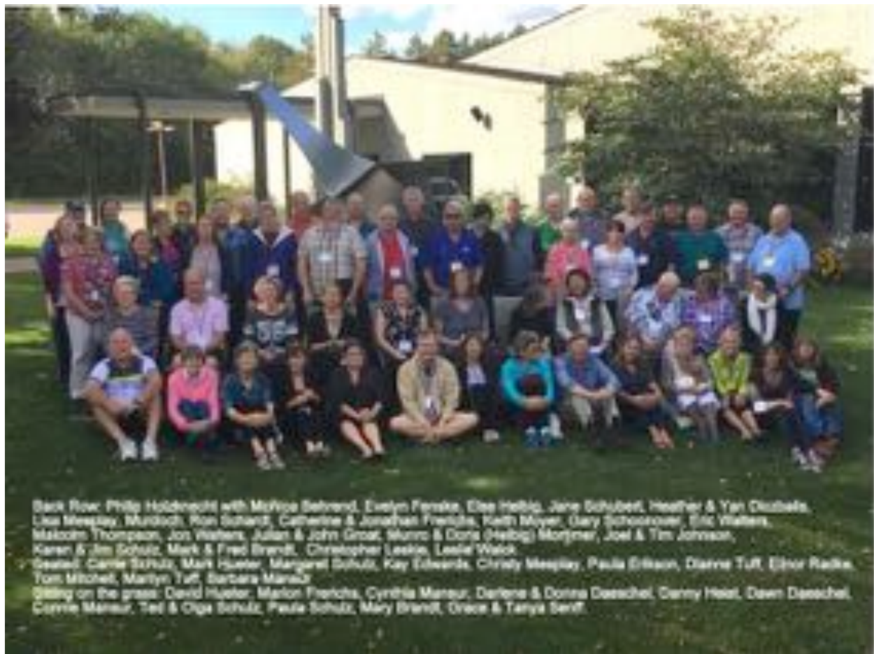
2017 at Mt Olivet