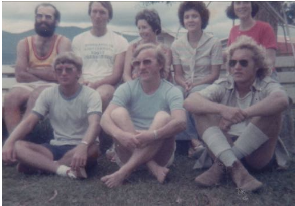
First photo: 1976 KLS 25th Anniversary